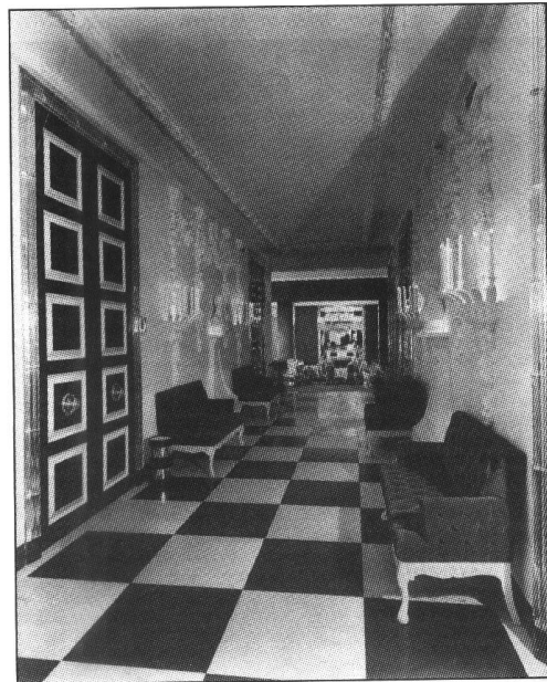
The Hampshire House arcade to the main Dining Room is a classic Dorothy Draper design in the Baroque look. Ceiling height doors are lacquered in black-berry with deeply cut white shaded mouldings. Door frames are crystal bolelection moulding. Grinling Gibbons plaster decorations appear on the walls and ceiling. Mouldings in the lobby were removed in the 1970's when the main lobby's decorations were "improved" by the co-operative board.